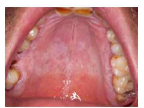
Figure 3. Nicotinic stomatitis in a 52-year-old male smoker of 20 cigarettes/day.

Figure 4. Smoker's melanosis in a 30-year-old